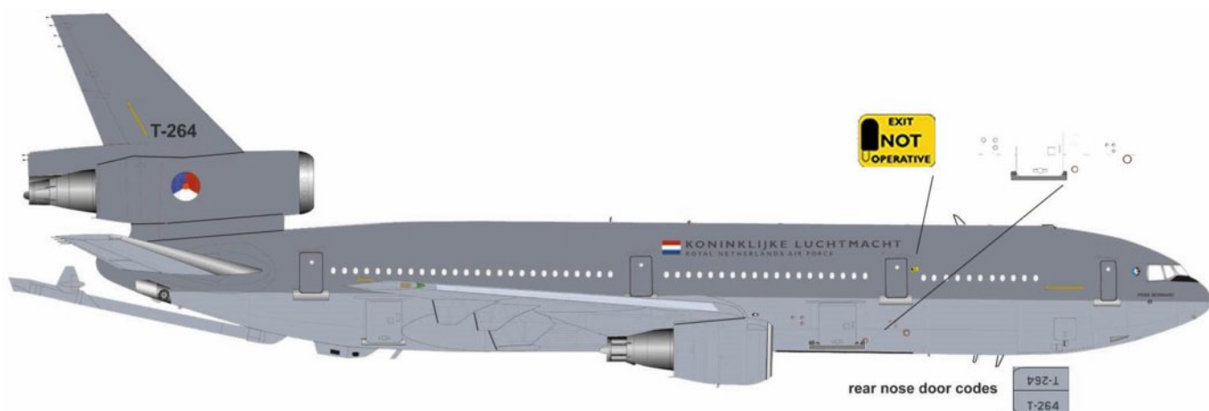
same plane KDC-10-30CF, "T-264" , named PRINS BERNHARD in low visibility grey with "dark tyre black" titles