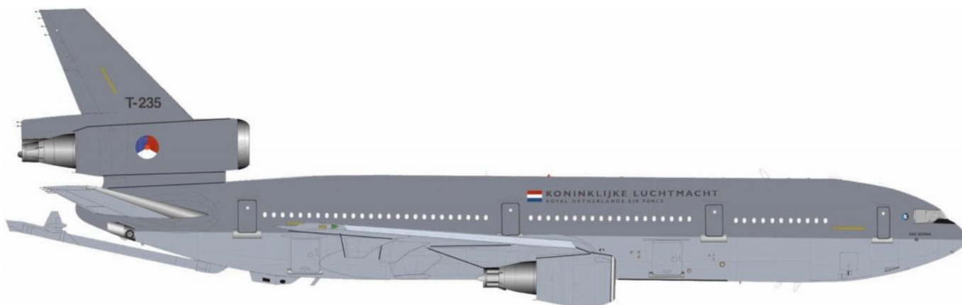
same plane KDC-10-30CF, "T-235" , name JAN SCHEFFER grey now with dark tyre black titles