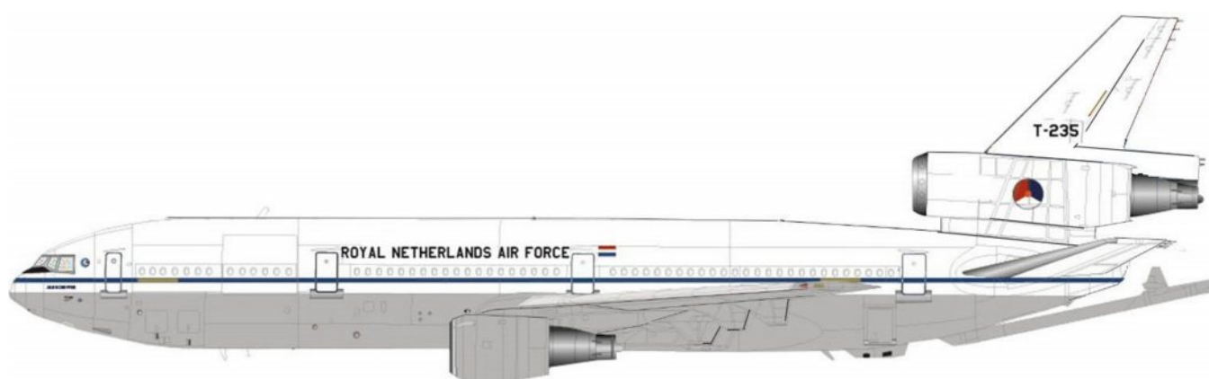
KDC-10-30CF, KLu "T-235", named JAN SCHEFFER (note starboard scheme is similar as T-264)