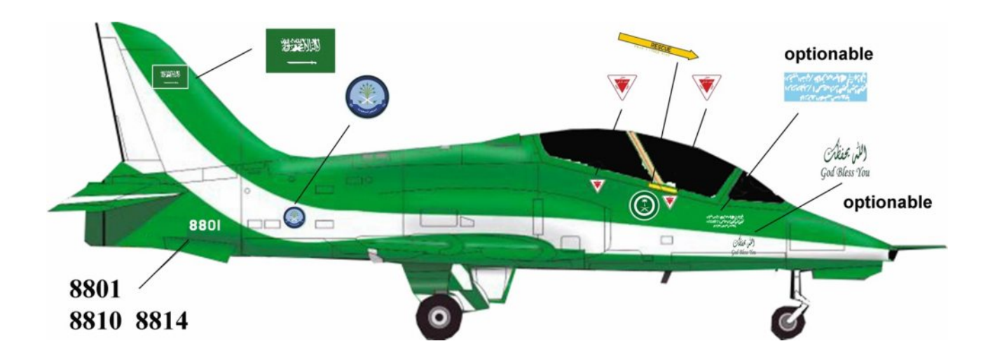
NOTE: 3 different white codes are provided: 8801, 8810, 8814