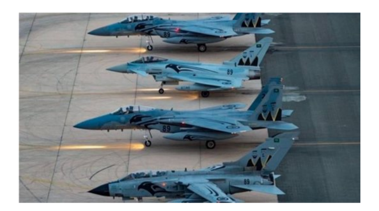
Tornado IDS, RSAF 89th anniversary scheme 2019

After all decals have been applied, finish the model with your preferred final gloss, matt or semi-matt varnish coats. This will also protect all the decals.